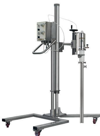
WITH PUMP M70/H52