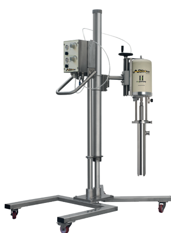
WITH PUMP M125/H85